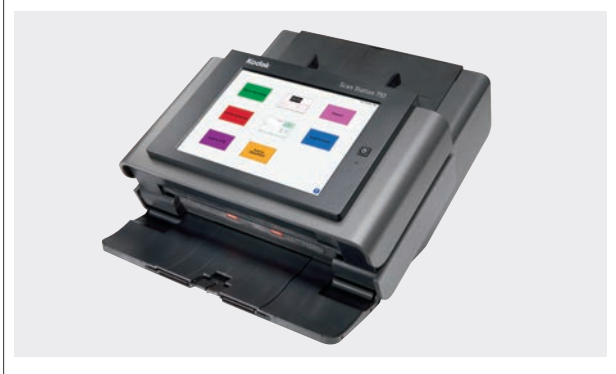
Robust build and quality