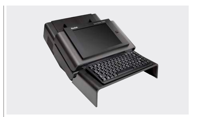
Shown with optional Kodak Scan Station Keyboard and Stand Accessory

Get the best possible performance from your scanners and software with a full range of Service and Support contracts available to protect your investment and keep productivity at peak levels. The three-year, worry-free warranty puts Kodak Alaris knowledge to work for you, helping your Kodak Scan Station 710 Scanners satisfy your changing business process needs for years to come.