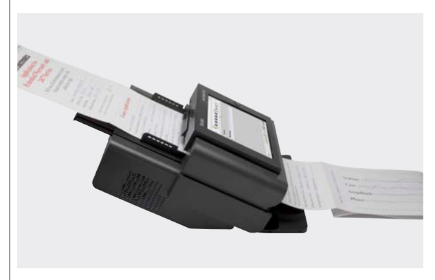
Improved paper handling