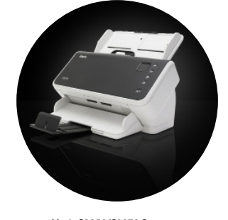
Alaris S2050/S2070 Scanners