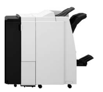
Multifunction Finisher FG10