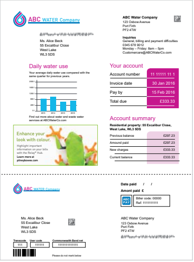
Sample colour statement