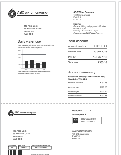
Sample black and white statement

Typical businesses have perceived printing in colour as being too expensive and too slow. It's not any more. Now, you can add the value of colour to your communications without decreasing profitability. The ComColor® GD prints full colour transactional documents faster—and for less. Its inkjet technology adds the engaging colour that your customers want for a similar cost to black and white print without any reduction in rated speeds.