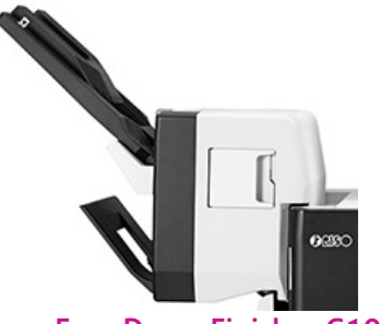
Face Down Finisher G10

*See High-Capacity Feeder and Stacker on page 3.